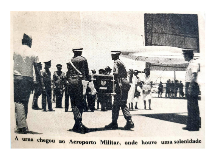
Figure 2 . Arrival of the urn with Anna Nery's mortal remains in Salvador on 02/04/1979.