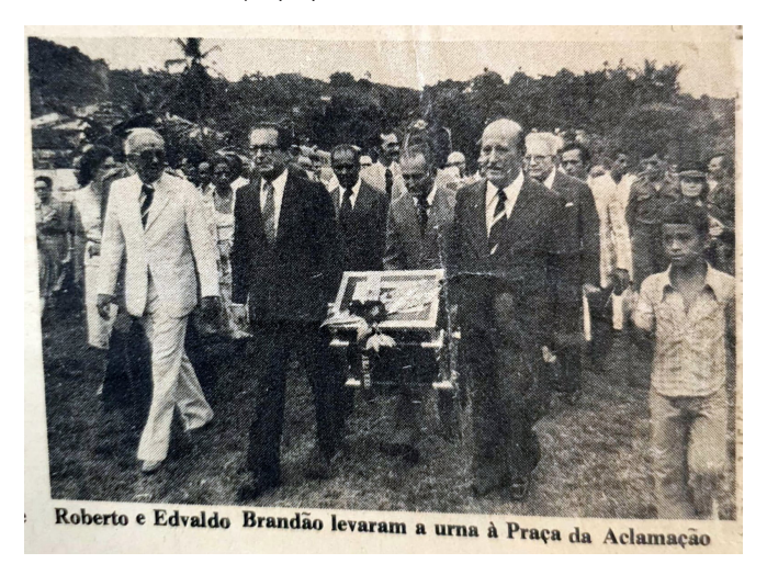
Figure 3. Authorities carrying Anna Nery's remains.