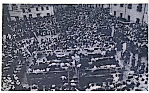
A Praça da Aclamação foi pequena para conter a população de Cachoeira, que recebia emocionada a sua grande herolna.